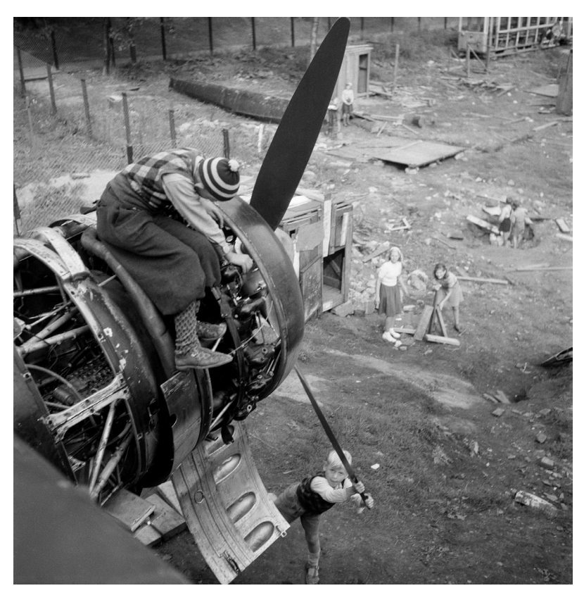
Picture 2. Junk playground in Gärdet, Stockholm ca 1940–1949.

in Møller-Nielsen's work contrasts distinctly with both traditional playgrounds and the rough and uncontrolled junk playgrounds. While the play sculpture certainly includes the idea of the playing and creative child, it also clearly embeds playgrounds and children's creative experience in a modernist context and the aesthetics of abstraction.