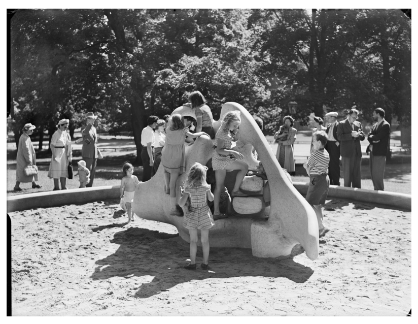
Picture 7. Egon Møller-Nielsen's "Tuffsen" in Humlegården, Stockholm 1949. Photographer: Sune Sundahl, DigitaltMuseum. Public domain.